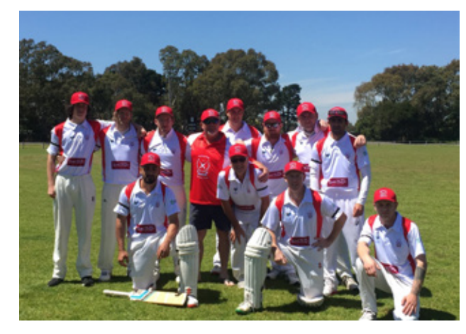
At HCC we don't believe that having different tiers of sponsorship is a fair comparison, so we only have two ways that you can get involved:

We believe this opportunity will allow you to ultimately generate more business through promotion of your brand to a wider, community-based audience. Supporting a community-based club is a rewarding experience and one we hope that you will be joining in the 2020 season.