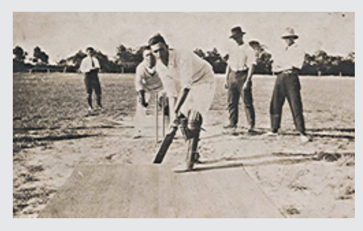
Cricket at the Heatherton Recreation Reserve cl920

In September 2004. The Deed of agreement between Kingston Council and Trustees of the reserve reflected the wish of the trustees that the land could never be sold and that it be used for recreational, educational and charitable purposes.